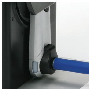
Colored LED indicator provides rewriter operation status