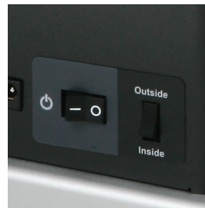
Rewinding direction switch to rewind "inside or outside" label rolls